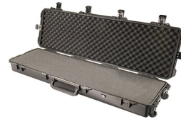
iM3300-X0001 With Foam