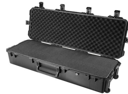
iM3220-X0001 With Foam