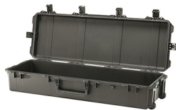
iM3220-X0000 No Foam