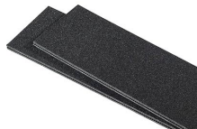
iM2600TPDIV Extra TrekPak Dividers