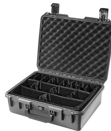
iM2400-X0002 With Padded Dividers