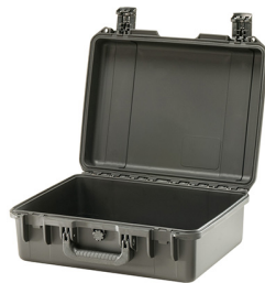
iM2400-X0000 No Foam