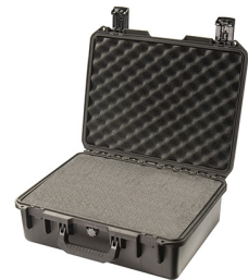
iM2400-X0001 With Foam