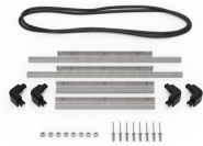
iM2300-BEZEL-LID Lid Bezel Kit