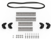
iM20XX-BEZEL Base Bezel Kit