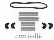
iM20XX-M4-BEZEL Base Bezel Kit (Metric)